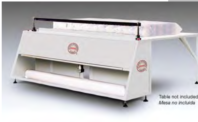
Table not included Mesa no incluida